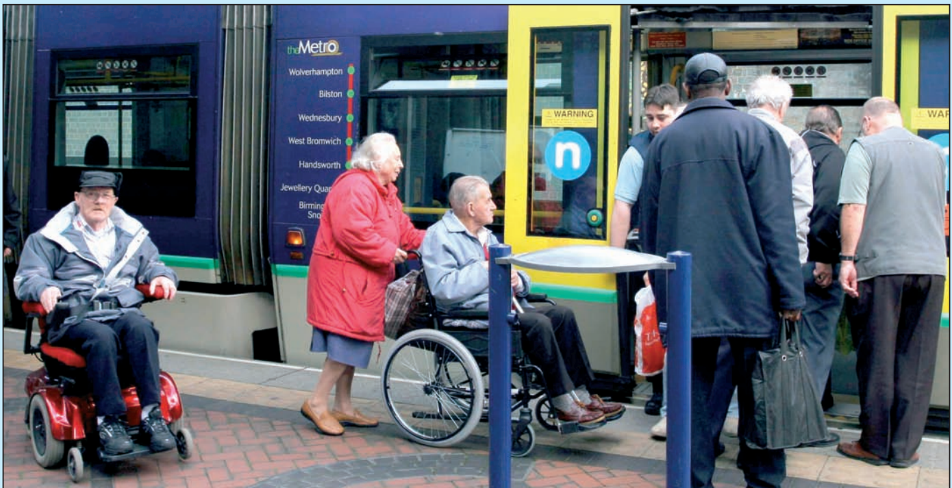
HELPFUL HAND: The Midland Metro is fully accessible for those with disabilities

More fascinating facts about the Metro to follow in future issues!