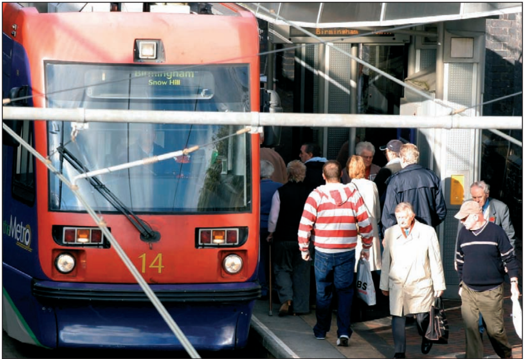
TIME PLEASE: The new Metro timetable will be in operation from Monday 3 March.

Alterations to the Sunday timetable will also be made