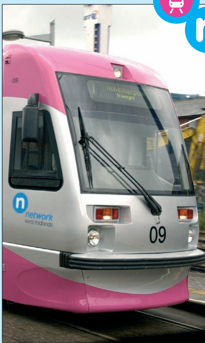
GOOD PERFORMANCE DESPITE CHALLENGES: 98.4% of tram services operated in accordance with the timetable during March.

Watch out for pictures of the naming ceremony in the May edition of Tramlines.